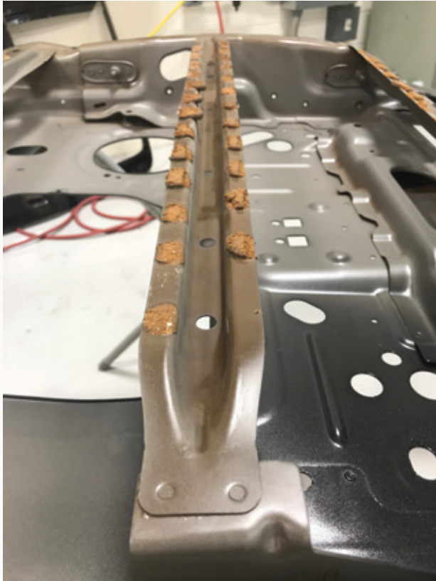
OEM Sound Dampening Material