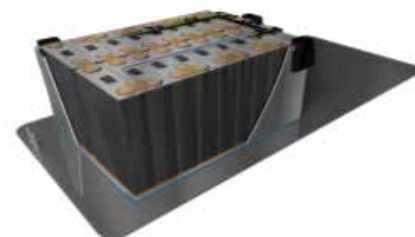
Prismatic Battery Pack